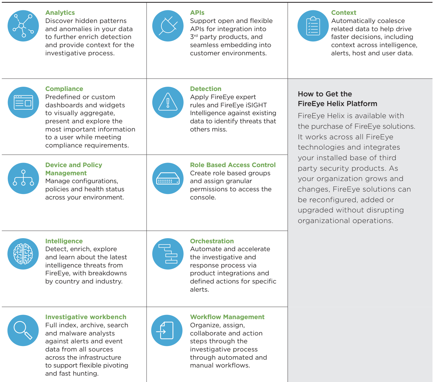
Figure 2. FireEye Helix features.

For more information on FireEye, visit: www.FireEye.com